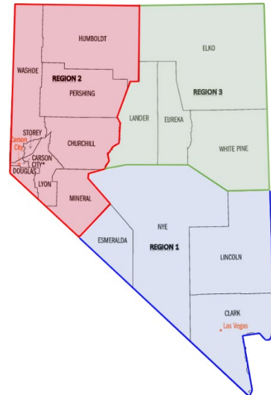
NEVADA REGION MAP

INCIDENT DESCRIPTION: The Nevada Operations Center (NVOC) is partially activated per the Division of Emergency Management (DEM) Spring Thaw Plan. The purpose of this activation is to increase our efforts for monitoring and preparedness.